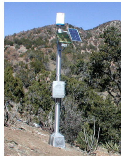
OneRain's StormLink™ Telemetry with real-time data transmitting to Contrail®

With OneRain's system, the BIA and the NMC know at all times that their system is up and running, or that it needs attention.