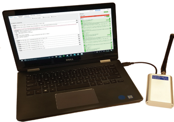
StormLink® IQ Receiver with Contrail® Field Decoder software

Troubleshoot gauge sites before driving away—receive and decode ALERT and ALERT2™ radio signals directly onto your laptop. Verify that transmitter and configuration is correct before leaving a site.