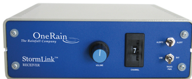
StormLink® RF Receiver

The StormLink RF Receiver is a 2-way transceiver. It can transmit and receive ALERT or ALERT2 for testing repeaters and two-way sites, such as those used by flasher or siren systems.