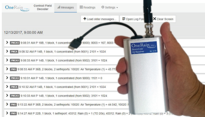
StormLink® IQ Receiver with rugged case and BNC antenna connector. Includes 90 deg swivelling stubby antenna tuned to VHF hydrology band

The ability to switch between ALERT or ALERT2 decoding; simultaneous decoding of multiple frequencies using either ALERT or ALERT2. You will be able to see a message as it goes completely through your network—as it is sent from a transmitted site in one protocol, and then repeated through a repeater in the same or another protocol.