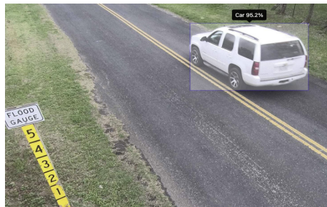
Vehicle detection on flooded roadways with Vision

The full-featured Vision license combines our Contrail Camera framework with machine learning models to detect objects in each image.