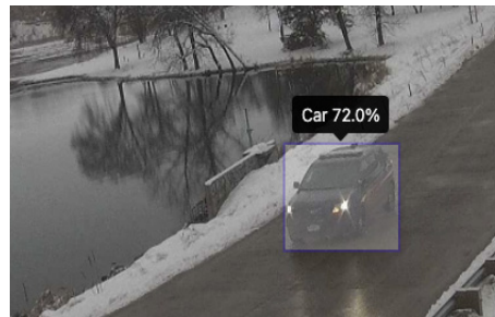
Vehicle detection on dam with Vision